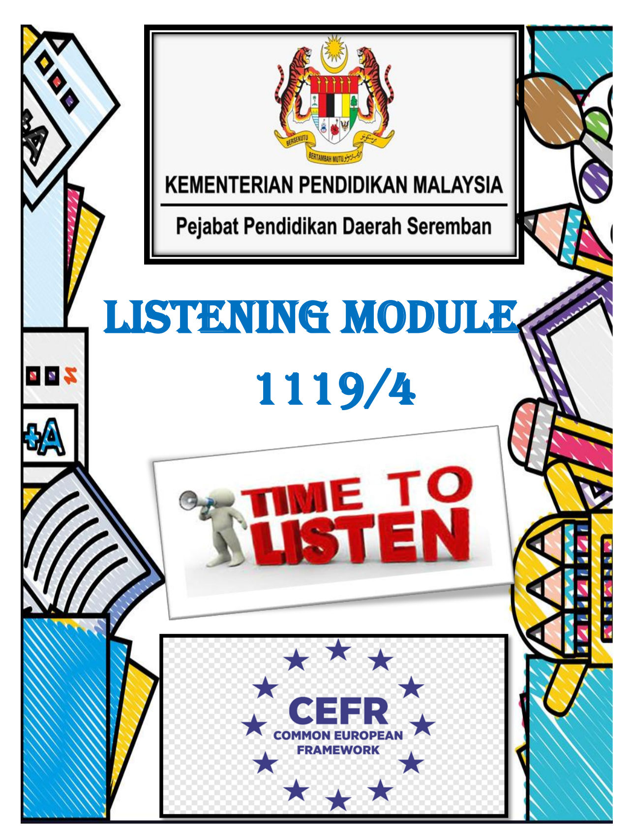
shared by @Pisike and @studyxuen on telegram